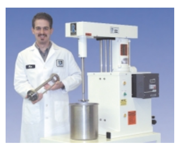
Rigorous methodology in most coatings development labs today requires the ability to compare test results using a rotor/stator mixer and a traditional high-speed disperser.

A mixer that allows you to bolt on a variety of agitators certainly saves space in the lab. By doing